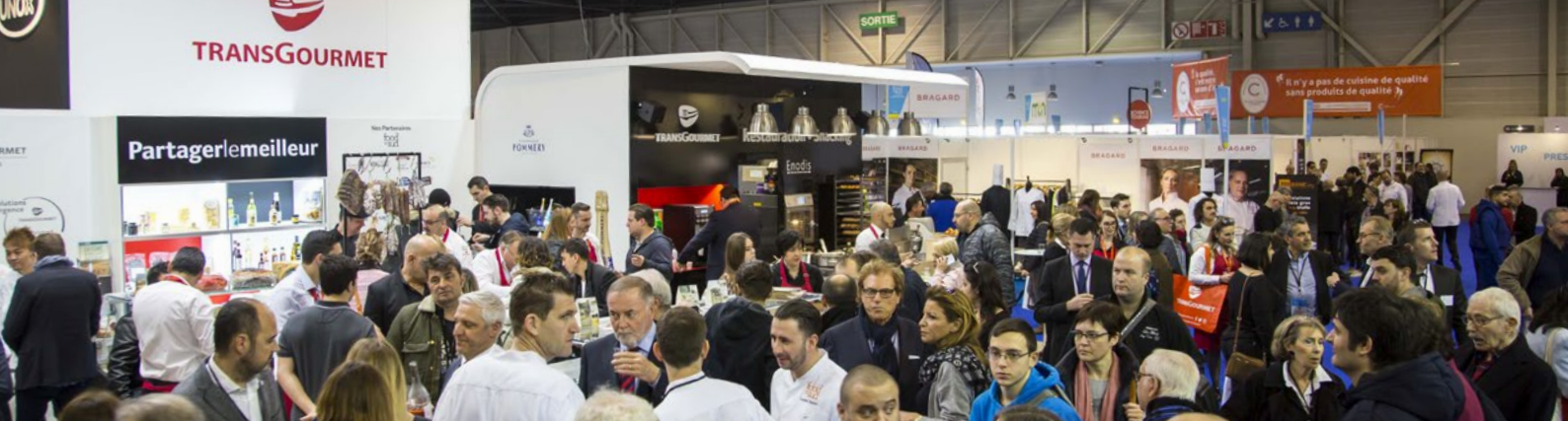
EXHIBIT ON FOOD'IN SUD , THE MOST DYNAMIC BUSINESS EVENT OF THE SOUTH OF FRANCE

Food' in Sud is the Mediterranean trade fair for all professionals in the food service and hospitality sector. Its dual purpose is to show the offers and concepts for this market, to support the evolution of the food service and to showcase the culinary heritage of Mediterranean region.